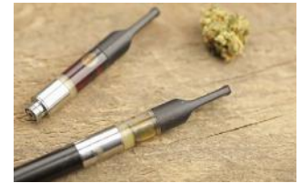
Vape Pen used with THC oil