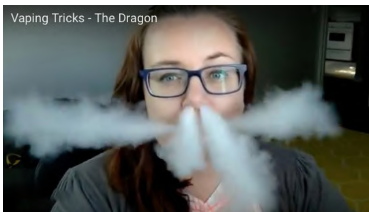
Vaping tricks are another major attraction of vaping.

Teens are increasingly becoming interested in "cloud competitions," in which adults compete to perform the best vaping tricks. In addition to being featured on social media, cloud competitions are becoming a regular feature at local vape shops with some offering thousands of dollars in prize money.