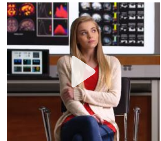
📺 Is vaping safe? Watch this short video from the CDC.

The report highlights that most e-cigarettes contain and release a number of potentially toxic substances, although exposure to these substances is considerably lower than those found in regular cigarettes.