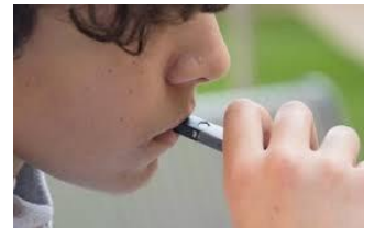
Teen using a JUUL

Nearly 1 in 3 high school seniors tried vaping in the past year.