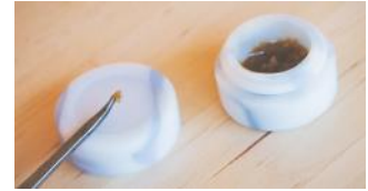
Dab, a concentrated form of marijuana with dab tool

Research also shows that about 1 in 6 teens who repeatedly use marijuana can become addicted, as compared to 1 in 9 adults. Further, kids who vape are more likely to use combustible cigarettes and try marijuana than their non-vaping peers.