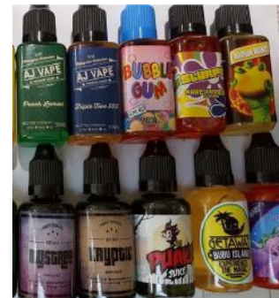
Flavors are one of the biggest attractions for vaping.